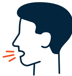
NEW OR CONTINUOUS COUGH