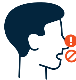
LOSS OR CHANGE IN TASTE AND/OR SMELL