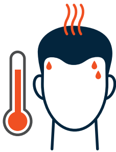
HIGH TEMPERATURE OR FEVER

DO NOT attend the event if you are showing any COVID-19 symptoms: